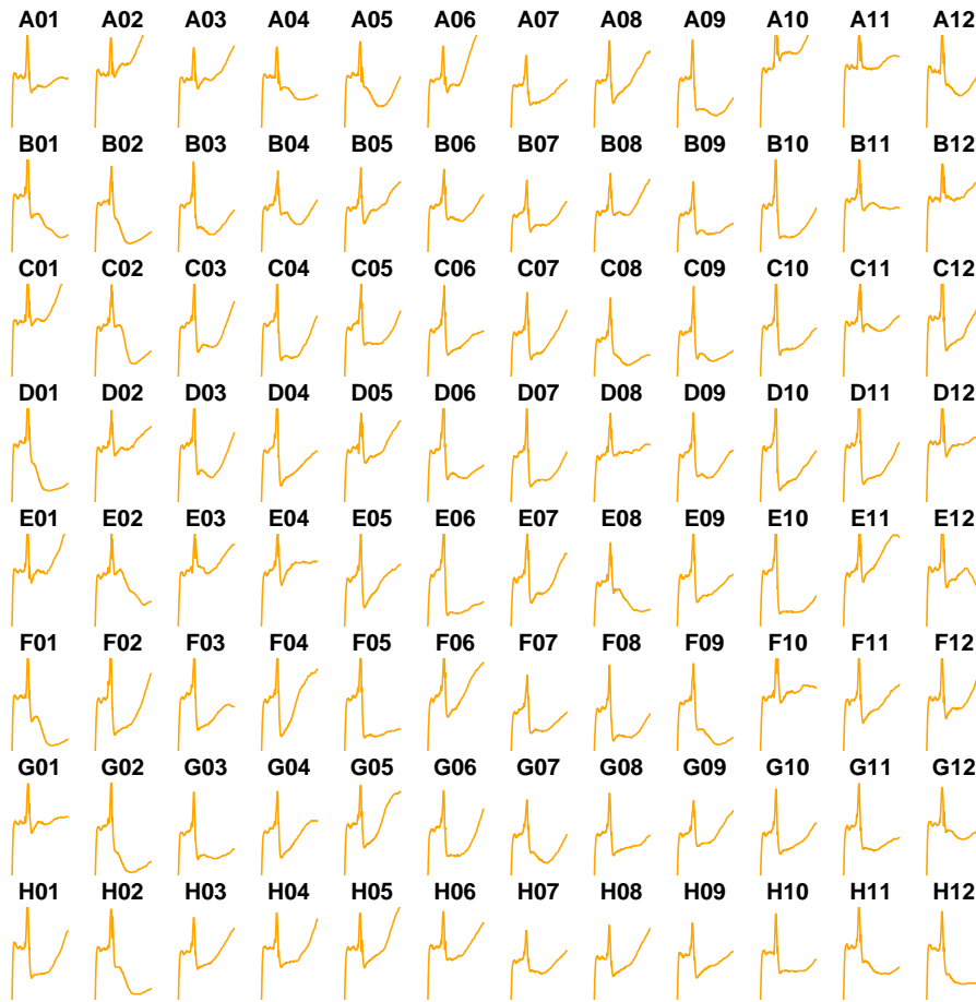
Figure 3: Plate view of a 96-well E-plate from a RTCA assay run.